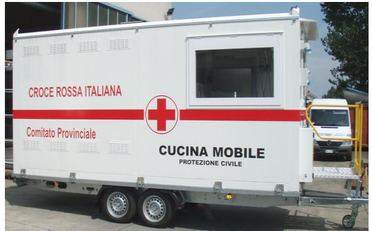
View of the unit from the "distribution" side, placed on the trailer transport system