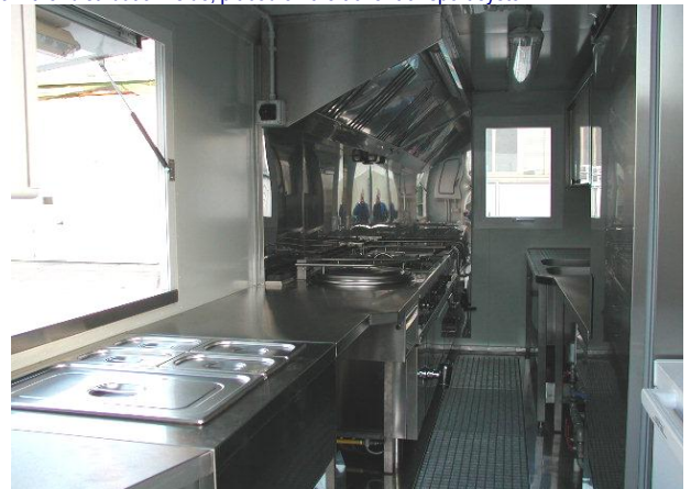
Interior view of the unit from the entry door: to the left, the cooking and distribution side to the right, the sink and fridges side