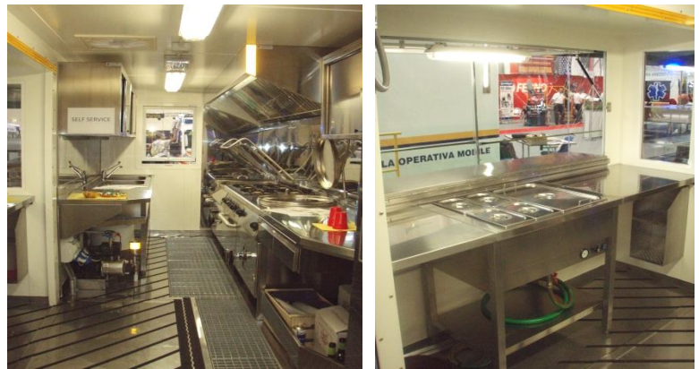
Interior view of the unit from the entry door and interior view of the volume expanding system, with the distribution area 'pulled out' from the supporting structure; platform and steps