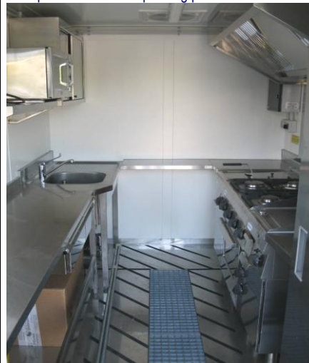
Interior view of equipment