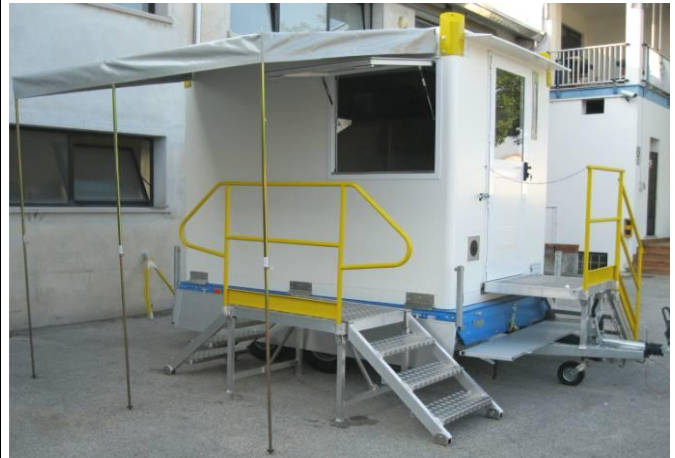
View/plan of the unit in operating position