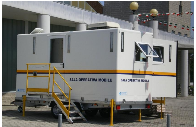
Full view of the worker entrance area, in operating position, on trailer