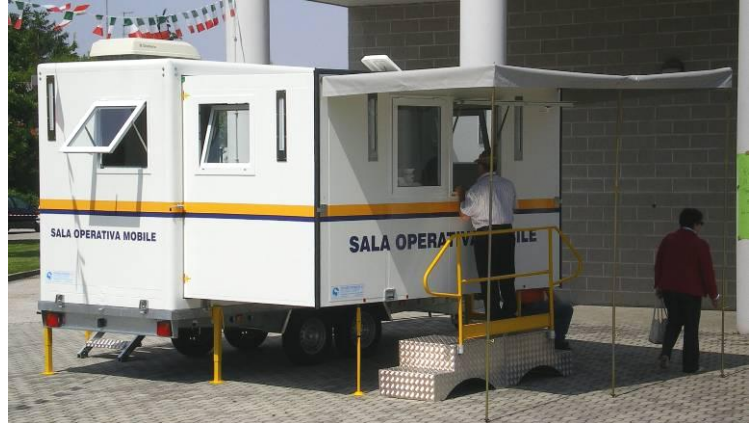
Full view of the user access area, in operating position, on trailer