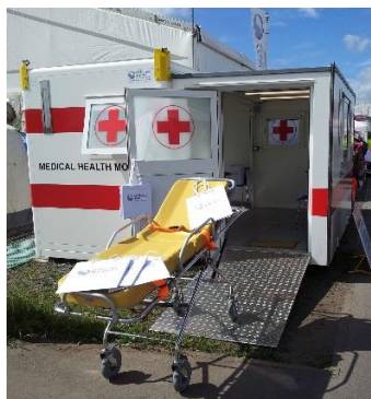
View of the unit in operation on the ground from the front