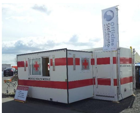
External view on expandable side of the unit