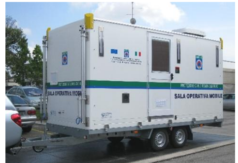
External view on the trailer of the unit