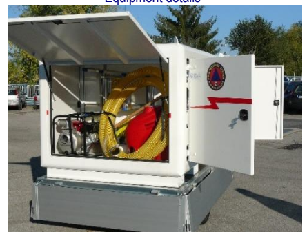
Detail of rear door