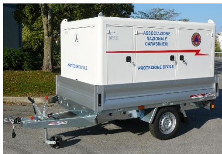
Overall view in transport position