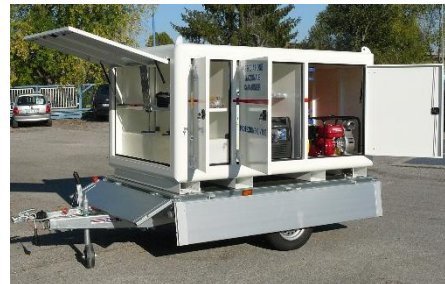
"Open" side view