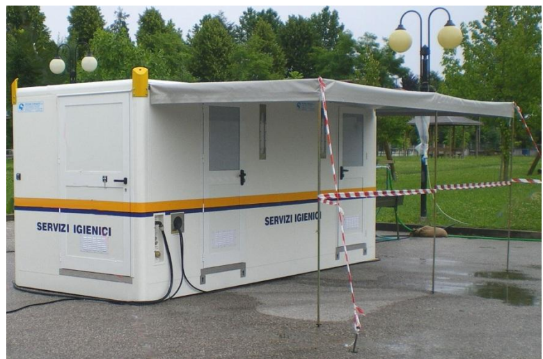
View of the unit's technical compartment and entrance side, set on the ground