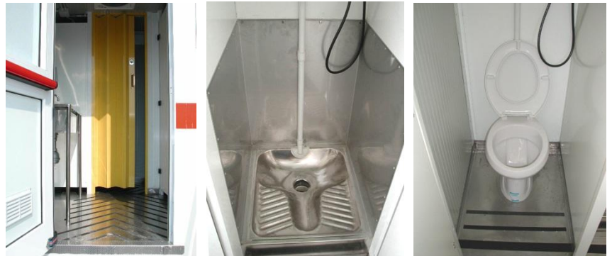
Interior details: entrance/exit – stall with "Turkish" toilet – stall with "standard" toilet