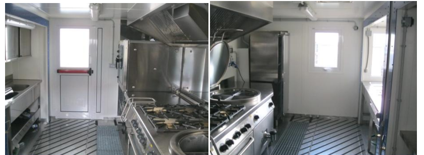
Interior view of the unit from the entrance door and interior view of the volume expanding system, with the distribution area and the sink area "pulled out" from the supporting structure