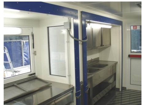
Interior view of the unit from the entrance door and interior view of the volume expanding system, with the distribution area and the sink area "pulled out" from the supporting structure