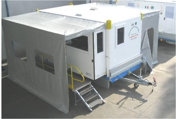
View of the unit from the "distribution" side, placed on the trailer transport system