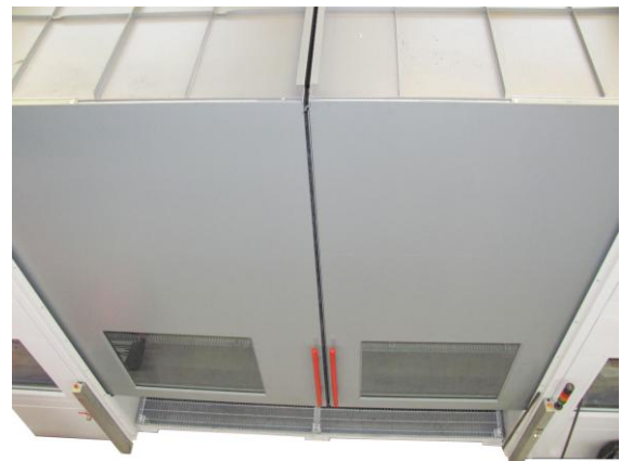
Carenatura per Macchina Utensile